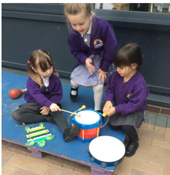
Let's make music and dance!

Nursery is always a busy place, as you can see in the photographs.