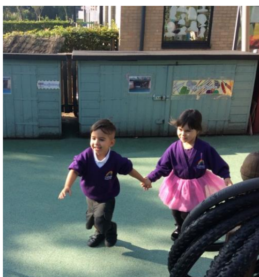
Run, run as fast as you can!