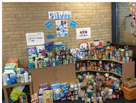
How it ended