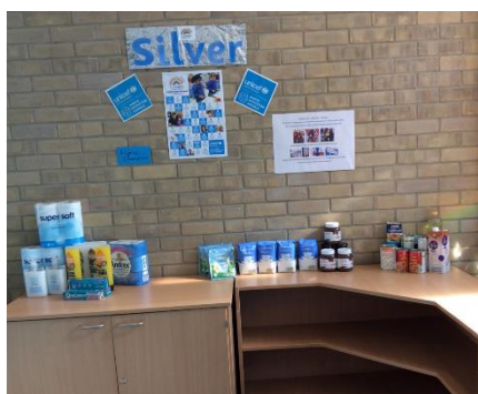
How it started.....

As part of this we have once again run the Colindale Foodbank appeal. It has been amazing to see the number of items donated by our families. The wide range of goods sent in was gratefully received by the foodbank volunteers.